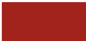
RAL 3000 Rosso Red Rouge Rot