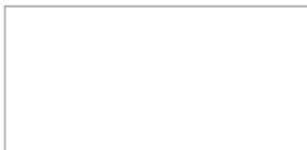
RAL 9003 Bianco White Blanc Weiß